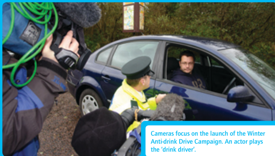
Cameras focus on the launch of the Winter Anti-drink Drive Campaign. An actor plays the 'drink driver'.

Policing was at the heart of significant political, community and social developments during the year. As a result, media focus was intense at local, national and international levels.