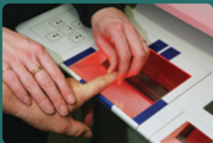
A suspect's fingerprint is scanned.

Rollout of the new service during 2006/07 to all custody suites has enhanced operational policing through real time identification of detainees and early notice of outstanding warrants/warnings against individuals. In excess of 2000 prints per month are currently processed and additional enhancements to Automated Identification capability are planned to continue during 2007/08 to provide PSNI with a world class service.