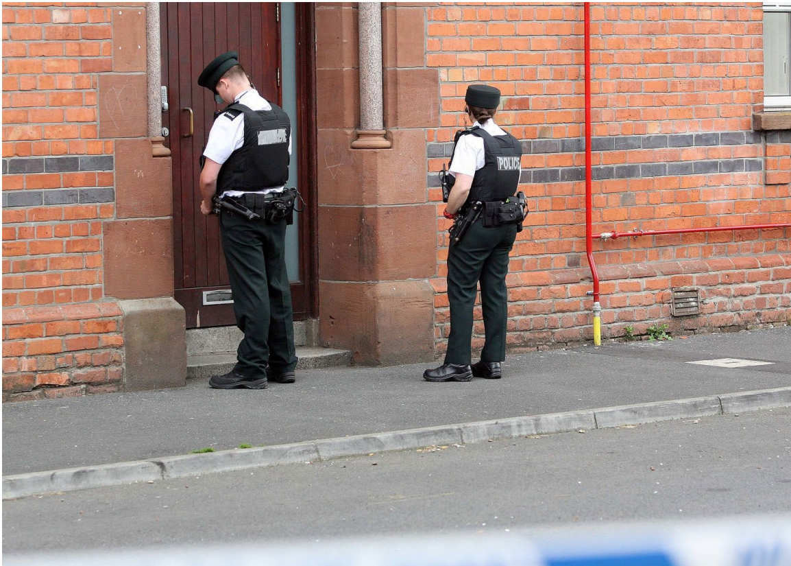
PSNI officers on duty.

CLOSE to double the number of Catholics than Protestants were arrested and charged over a five-year-period in Northern Ireland, according to PSNI statistics released to The Detail.