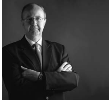
Oversight Commissioner Al Hutchinson

This is my third report since being appointed Oversight Commissioner in January of 2004, and the twelfth in a series of independent oversight reports that commenced in January of 2001. The Report of the Independent Commission on Policing in Northern Ireland, also known as the Patten Commission, and the 175 recommendations for policing change upon which our oversight work is based, along with our results-based method of determining progress and our previous oversight reports, can be found on our website at: www.oversightcommissioner.org