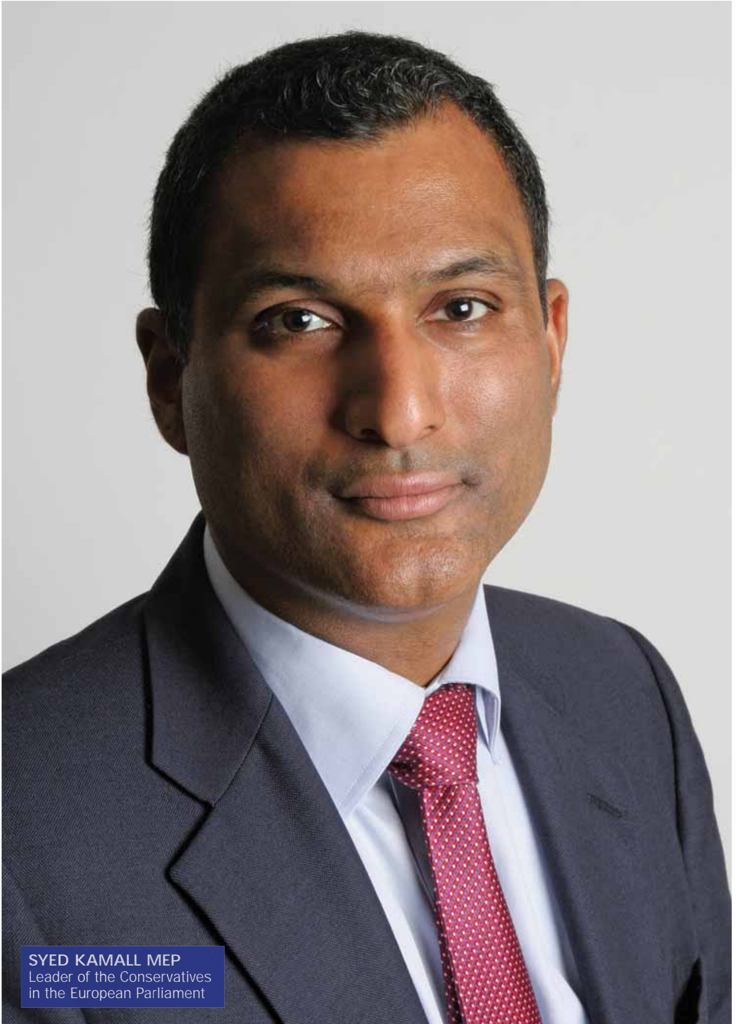
SYED KAMALL MEP Leader of the Conservatives in the European Parliament