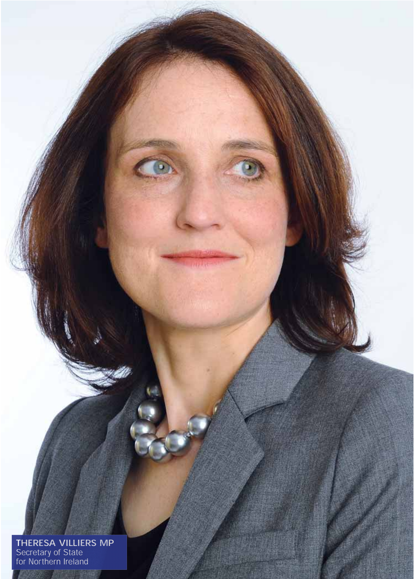
THERESA VILLIERS MP Secretary of State for Northern Ireland