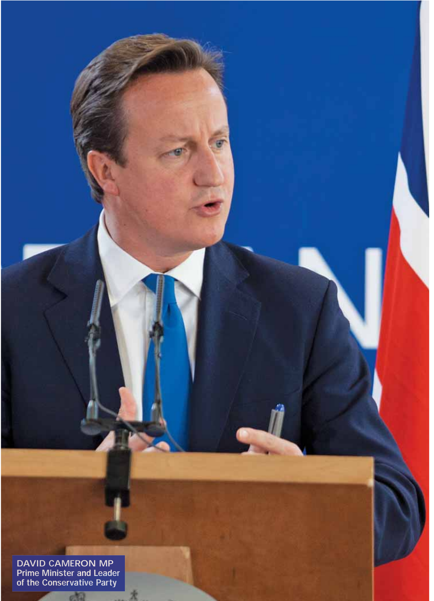
DAVID CAMERON MP Prime Minister and Leader of the Conservative Party