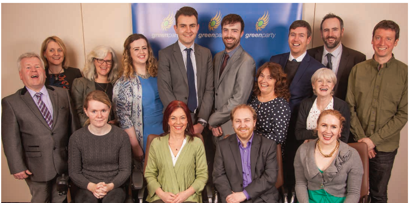
Green Party candidates for the 2017 Northern Ireland Assembly Elections

By tackling waste wherever we see it in our economy, society and environment, we can make Northern Ireland a better place for us all to live.