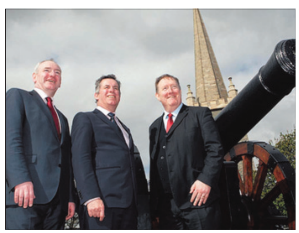
"The SDLP has the best record in promoting cultural diversity"

In the next Parliament, we will seek to expand EU support programmes for cultural and linguistic diversity, and to secure more funding for Irish language projects.