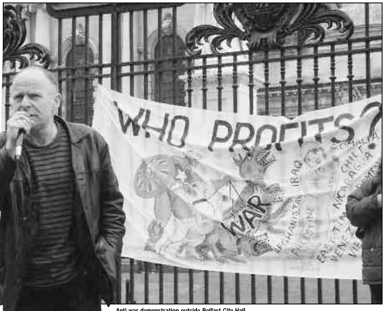
Anti-war demonstration outside Belfast City Hall

The SEA asks for your Number One now, to give a mandate to those who lined up outside, against the war.