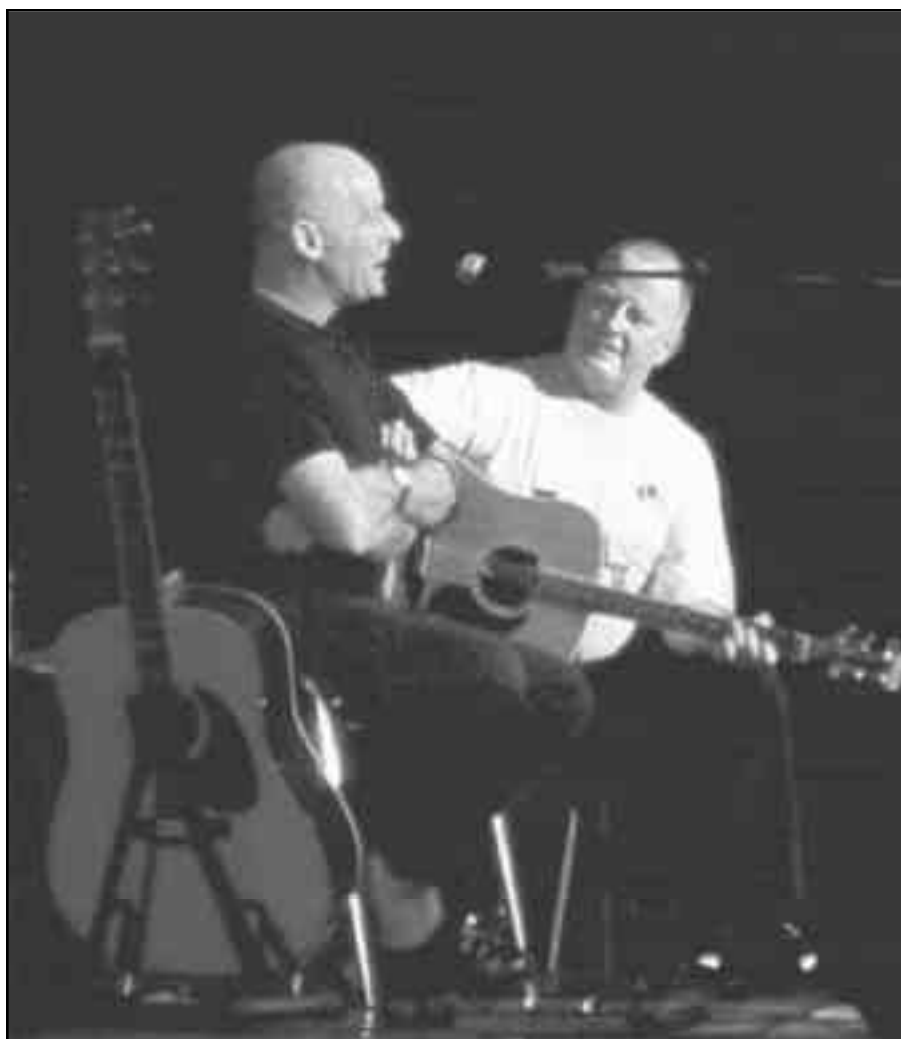
Eamonn McCann singing on stage with Christy Moore at the 30th anniversary Commemoration concert in the Rialto, Derry