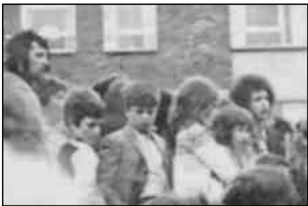
Housing Action protest in Derry in 1968

We will work within the Assembly and, even more importantly, outside the formal arena. We see the future as lying not in people looking to MLAs to deliver things for them, but in people organising to change things for themselves. The main function of a MLA should be to encourage the marginalised and done down to mobilise and fight back.