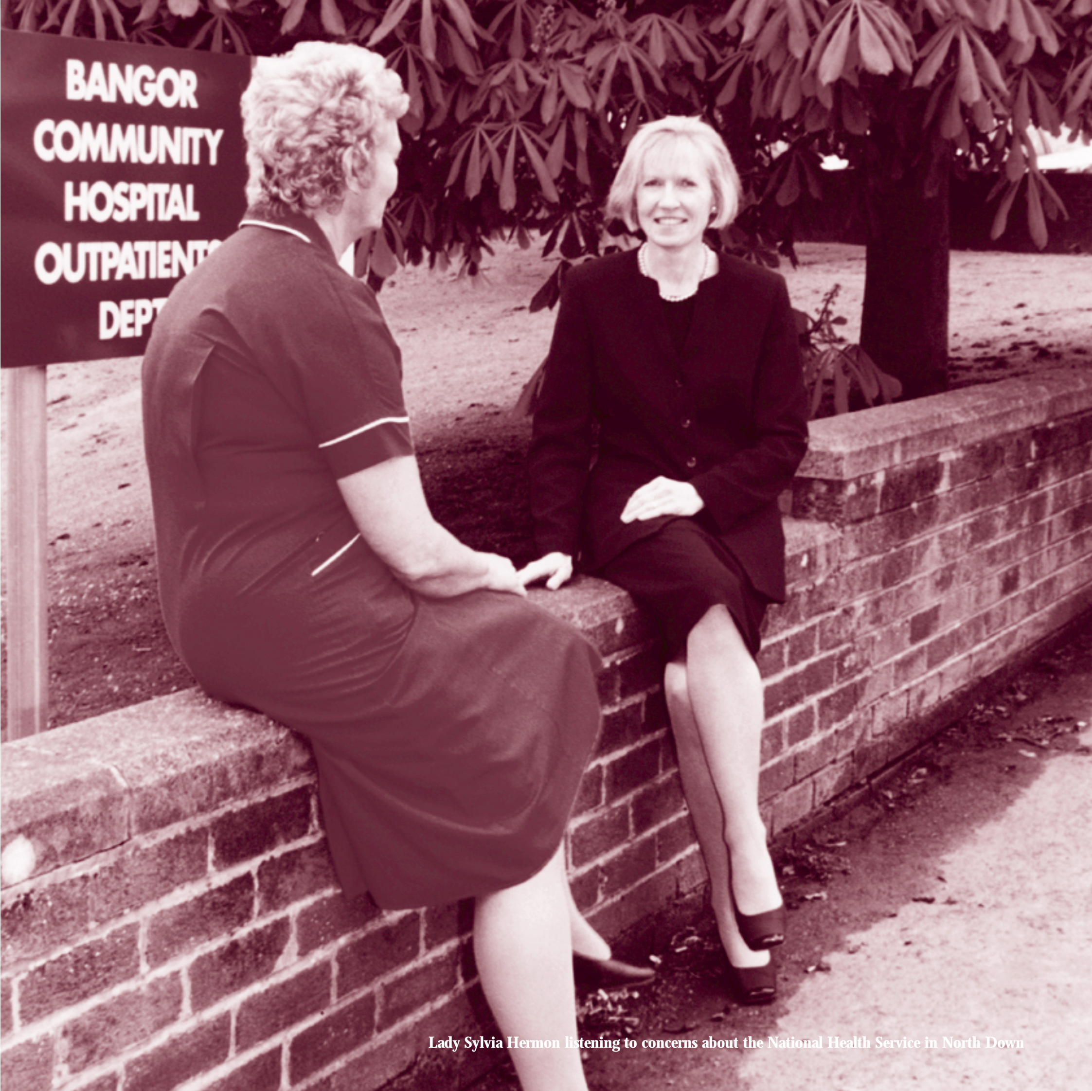
Lady Sylvia Hermon listening to concerns about the National Health Service in North Down