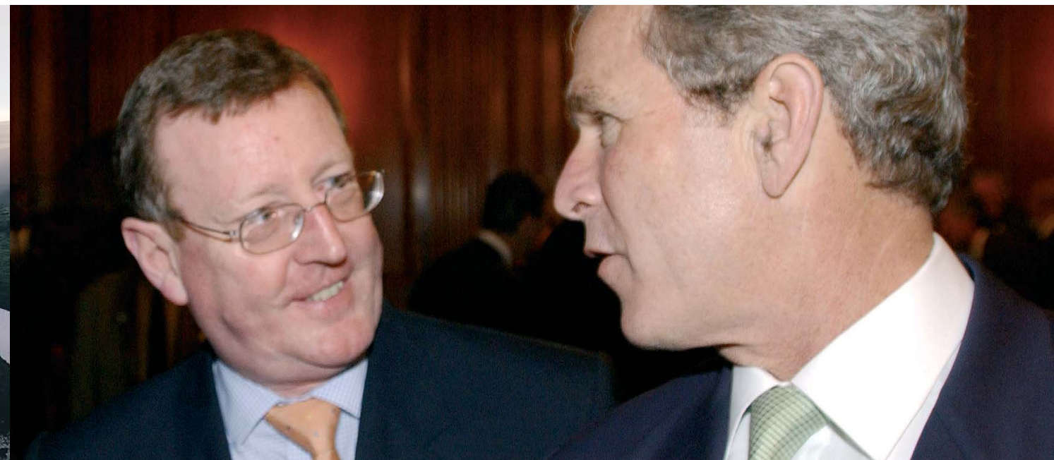
David Trimble, Party Leader and candidate for Upper Bann with the President of the United States of America, George W. Bush.