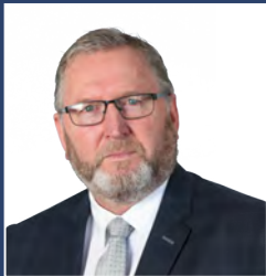
Doug Beattie MC Upper Bann