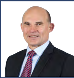
Roy Beggs East Antrim