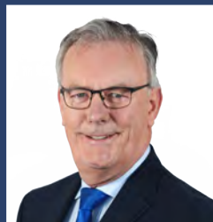
Mike Nesbitt Strangford