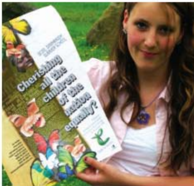
Pictured at poster launch of the Summer School