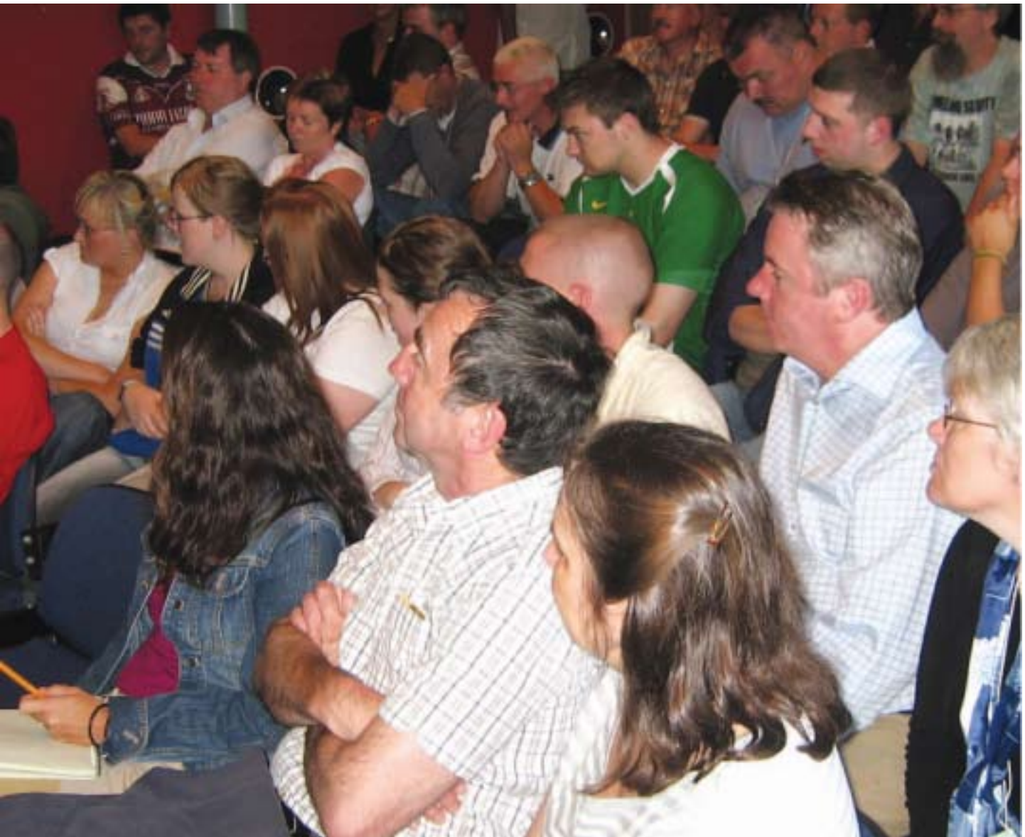
Audience at the session featuring loyalist and republican ex-prisoners