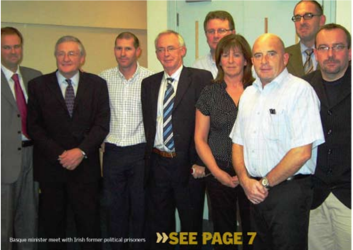
Basque minister meet with Irish former political prisoners

OCTOBER - DECEMBER 2006 VOLUME 8 ISSUE 3