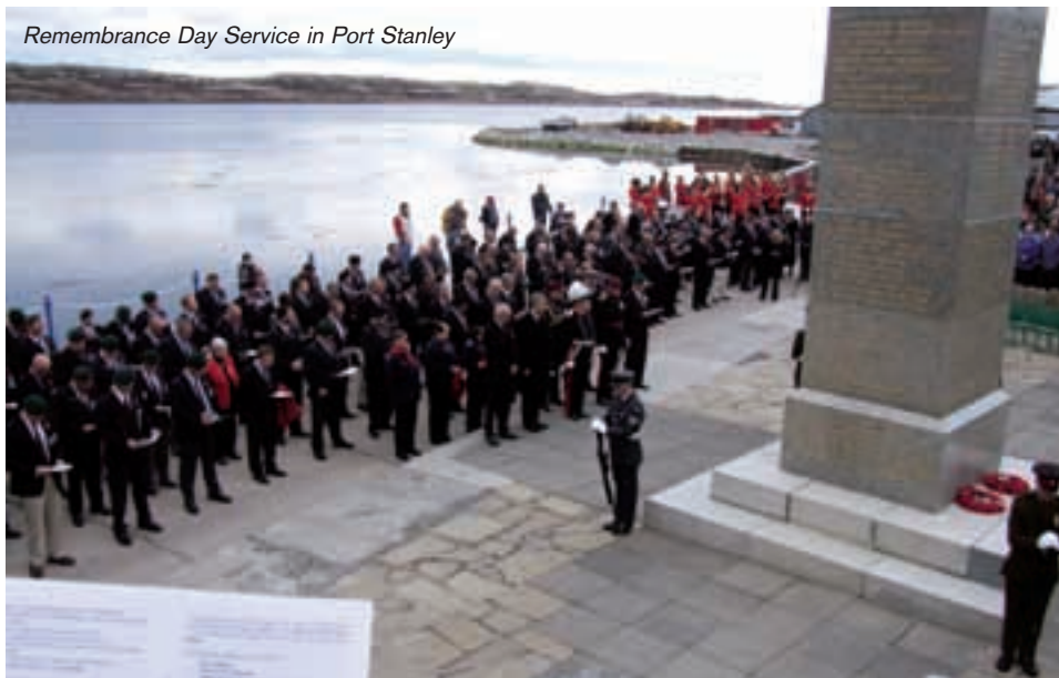
Remembrance Day Service in Port Stanley