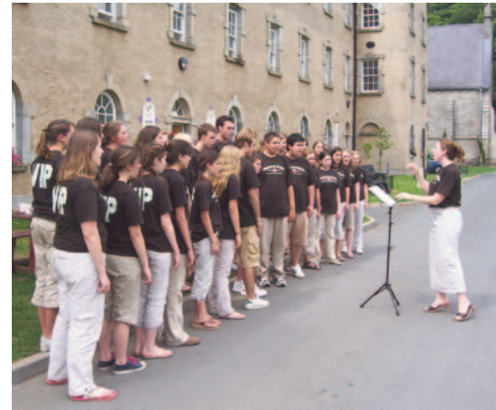
'Voices in Praise' Youth Choir from Maryland, USA at Glencree, July 2006.

The 2007 Summer School takes place over the weekend of 24th - 26th August.