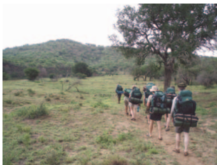
Participants on the Sustainable Peace Programme make their way through the wilderness of KwaZulu Natal in November.eps

In 2006 there was also a range of activities aimed at participants from the LIVE (victim/survivor) strand of the programme. These included a series of preparatory workshops leading to the second joint Survivors and Former Combatants Convention, in June. This Convention highlighted again the many pitfalls and challenges involved in dialogues between survivors and former combatants. With the help of an international co-facilitator on the 2005 and 2006 conventions, a new initiative was embarked upon that, firstly, involved the gathering of detailed feedback from a range of participants. Secondly, a core group of participants, from both the victim and former combatant strands, were invited to become part of a team that would use this type of information on an ongoing basis. It was hoped it would help them design and develop more effective future programme activities. A promising first meeting of this grouping took place in October.