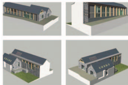
Images of the new IFI funded building at Glenree on which construction will begin in 2007.