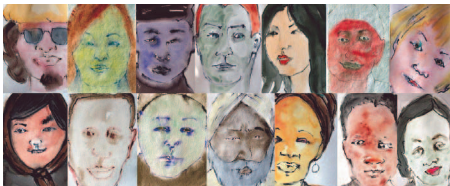
Images from the 'Welcome Strangers' Exhibition.

The work of Glencree in Haiti focuses on bringing all the players of influence in the poverty stricken slum areas together for dialogue and for creating a future for those who live there. This includes gang leaders, churches, community workers, politicians and business leaders. The training of local people to facilitate this difficult dialogue is part of the legacy strategy of this work so that when we leave the work can be continued locally. This empowerment of local community leaders is at the core of the Glencree International work. We recognise that in order to break the violence/poverty cycle, economic development is essential and we are working with Concern and the business community to create micro projects in the area.