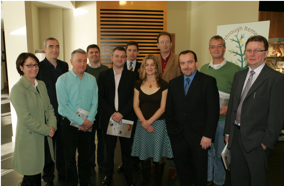
Members of the HTR Truth Recovery & Acknowledgement Sub Group at the launch in Belfast