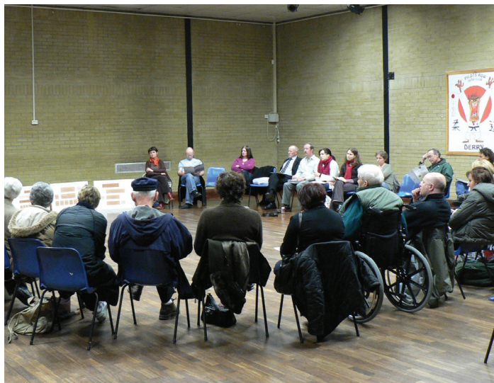
Discussion event on Making Peace with the Past held in Derry/Londonderry

To continue to encourage deeper discussion, debate and consultation on truth recovery and the five possible options outlined in Making Peace with the Past , HTR and the Truth Recovery & Acknowledgement Sub Group have facilitated seminars and events with interested groups and