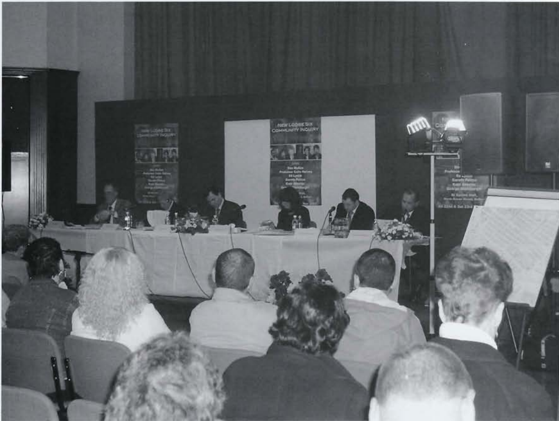
International panel of jurists taking evidence