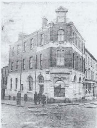
Lynch's Bar circa 1973, Junction of New Lodge & Antrim Road