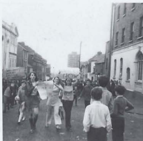
Facing South on New Lodge Road Lyceum to Left, Lynch's Bar to Right