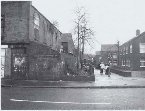
Edlingham Street running to Duncairn Gardens November 2002