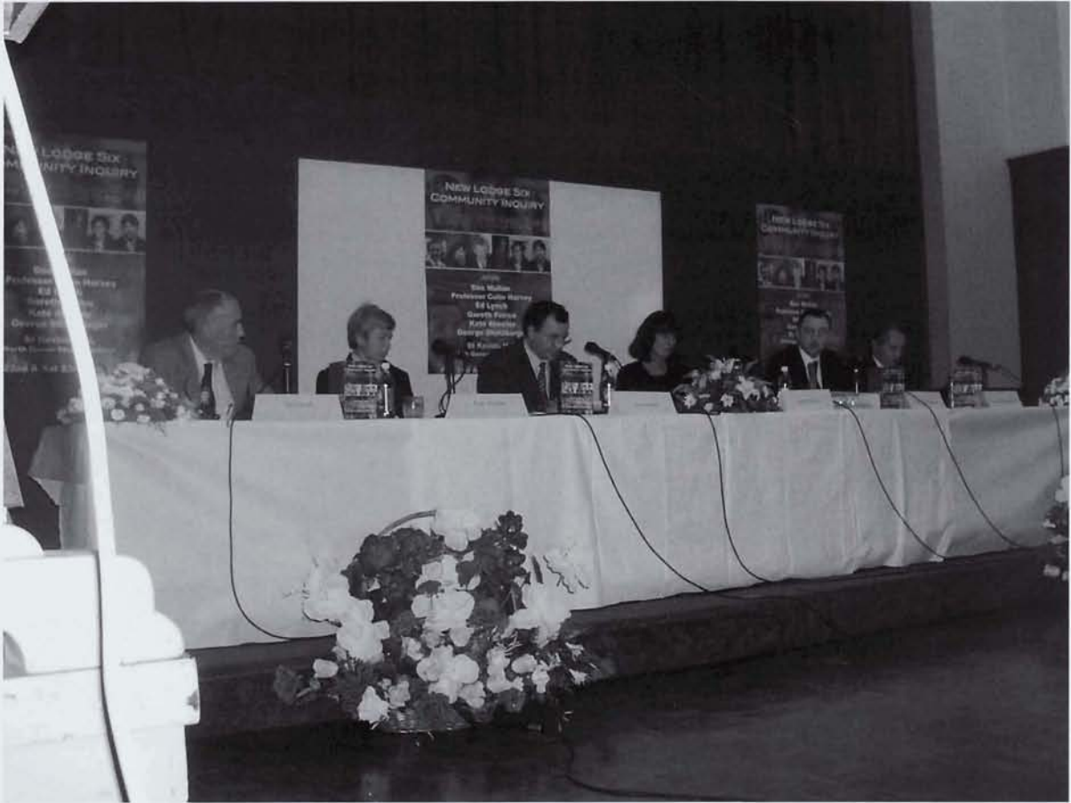
The panel of jurists