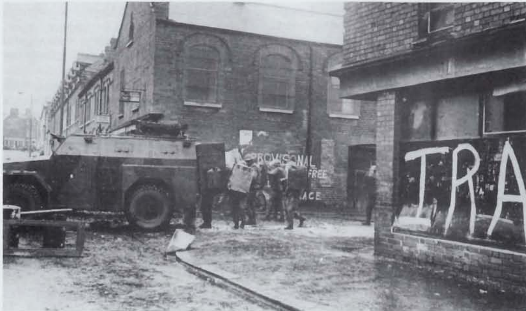
Circle Club at the corner of Edlingham Street & The New Lodge Road, circa 1973