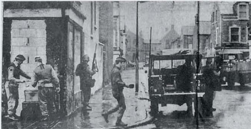
Edlingham Street running towards New Lodge Road, circa 1973