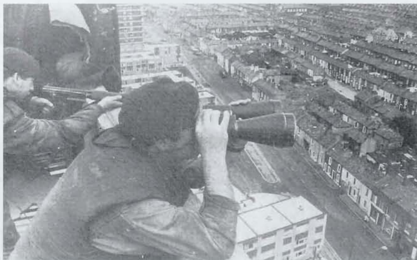
Soldiers at top of flats looking on to the New Lodge Road, circa 1973