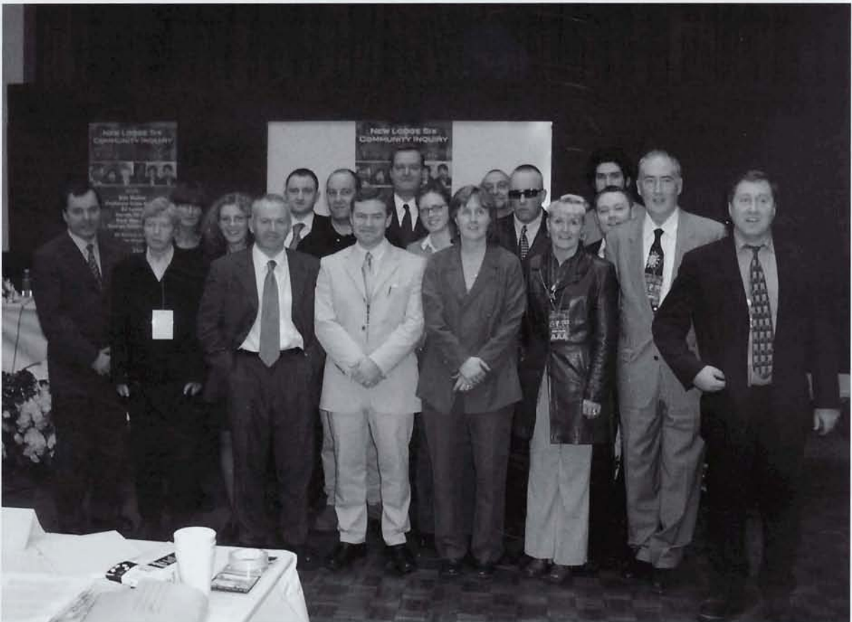
New Lodge Six jurists, legal team and Committee members