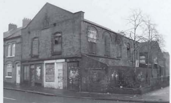
Old Circle Club November 2002, where Ambrose Hardy was shot