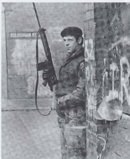
Junction of New Lodge Road and Edlingham Street, circa 1973, where four of the men were shot dead.