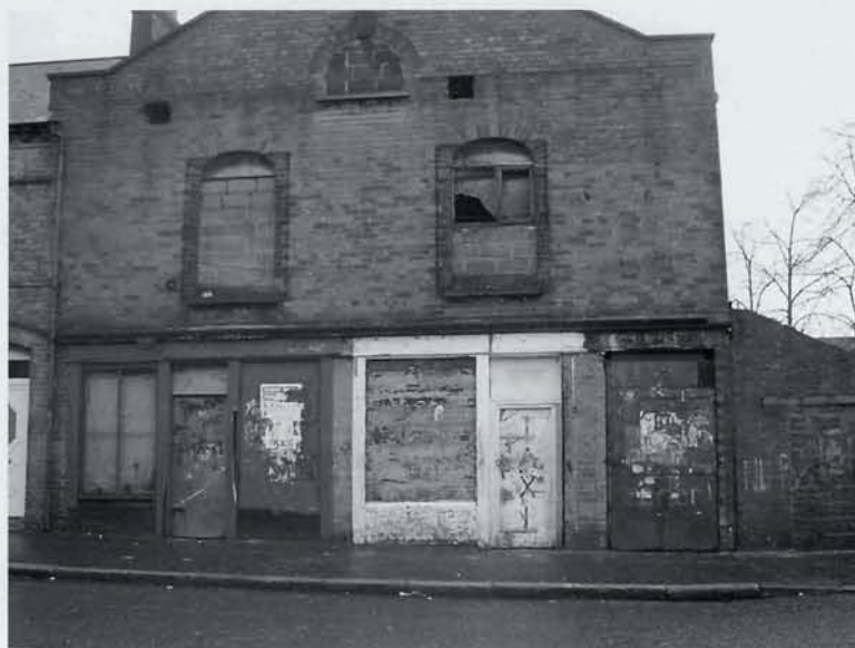
Doorway on right of photo where Ambrose Hardy was killed, November 2002