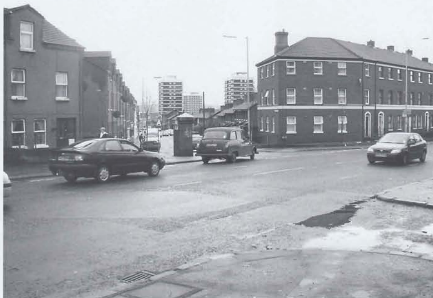
Junction of New Lodge Road & Antrim Road Present Day