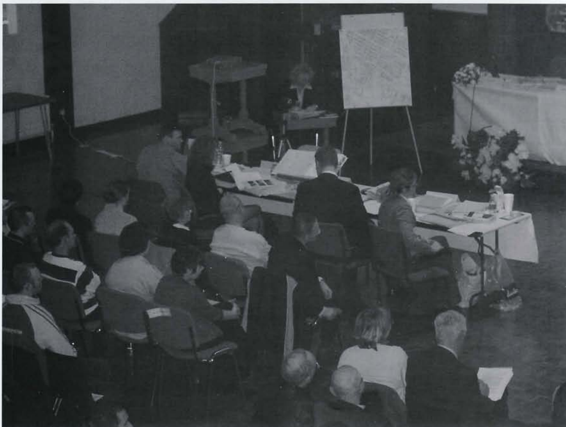
Madden & Finucane legal team presenting evidence