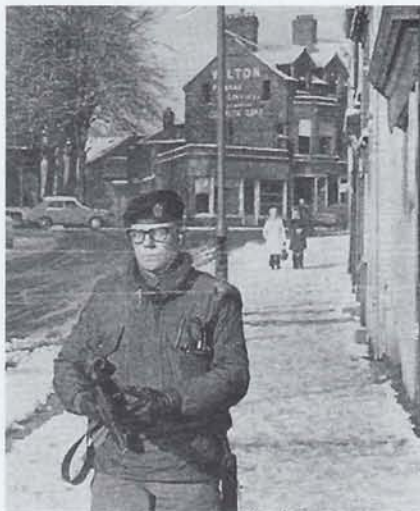
Facing North on New Lodge Road Lyceum Theatre Entrance on Right