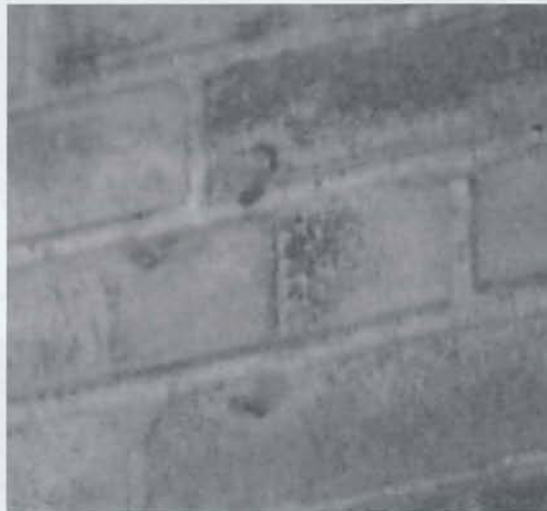
Bullet marks above entrance of Circle Club where Ambrose Hardy was shot dead