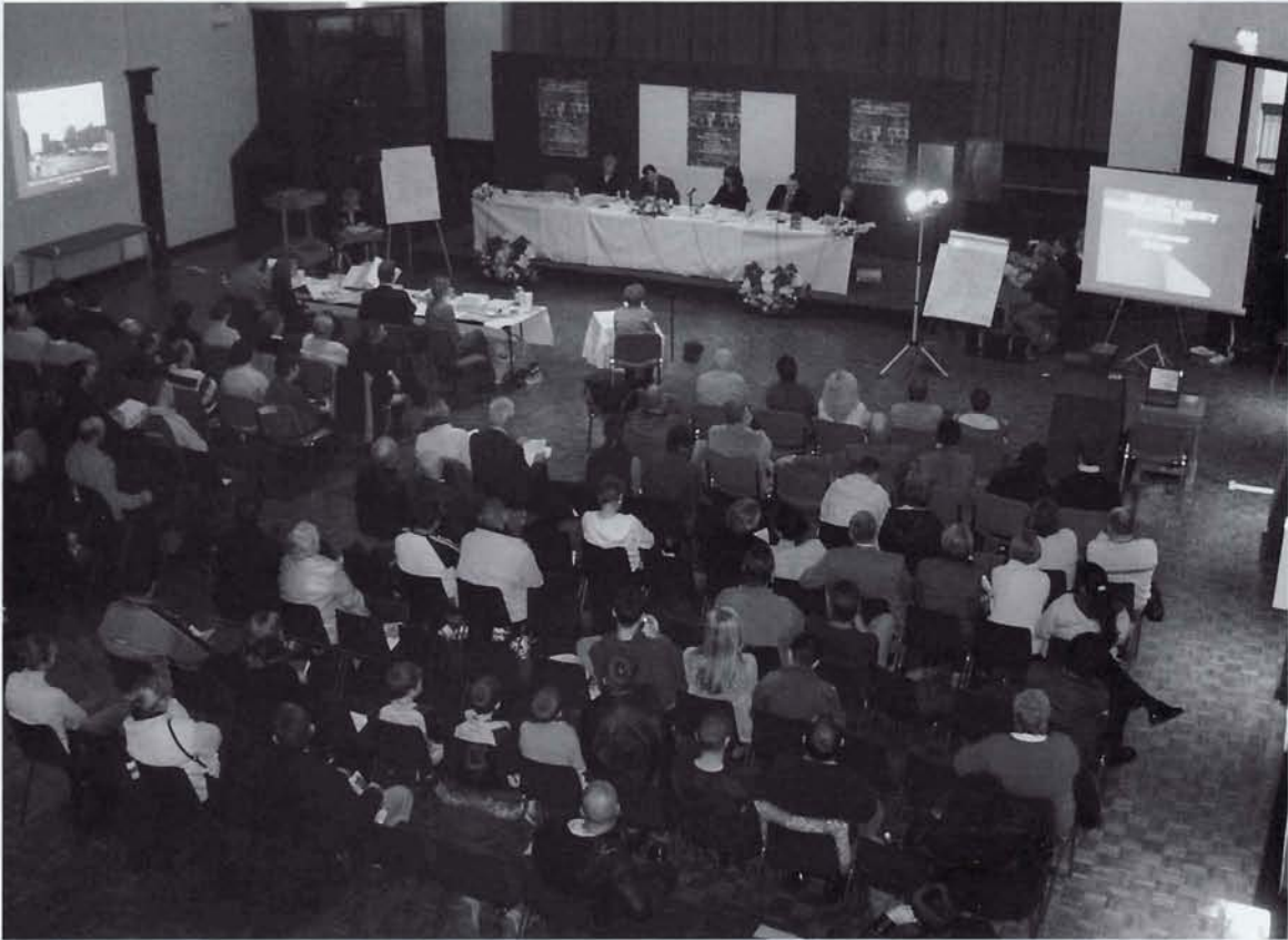
New Lodge Six Community Inquiry