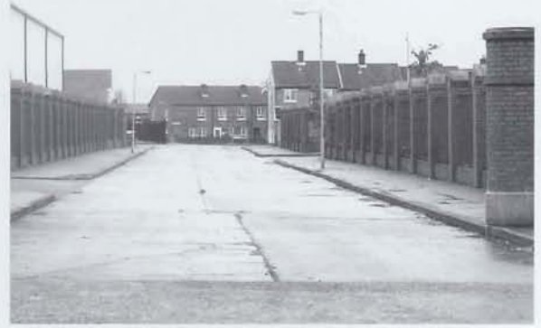
Edlingham Street entrance from Duncairn Gardens to Tigers Bay November 2002