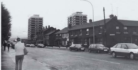
View from doorway of Circle Club to the Flats, November 2002