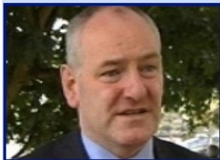
Backs tribunal call