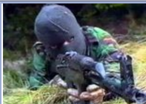
IRA meeting unlikely