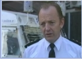
PSNI's Sir Hugh Orde