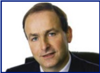
Minister Micheal Martin