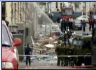
Civil action continues