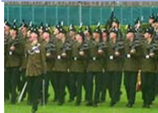
Royal Irish Regiment