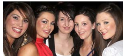
Had a big night out? Click here to send us your pics