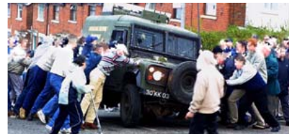
Holy Cross Primary School protests