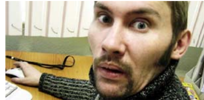
-isms: 'You should click here - it's class like'