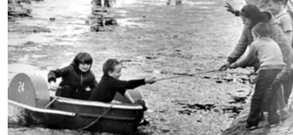
Park life. Victoria Park boat lake