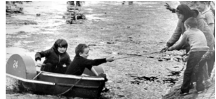
Park life. Victoria Park boat lake