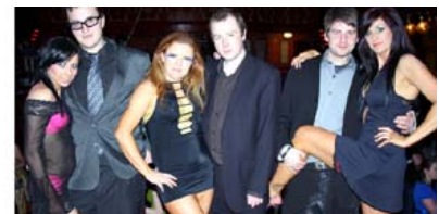
Had a big night out? Click here to send us your pics