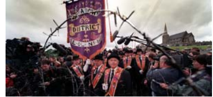
The Drumcree protests