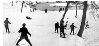
Ulster under snow