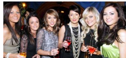
Had a big night out? Click here to send us your pics