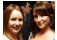
Northern Ireland Nightlife in Pictures