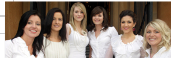
From Belfast catwalks to red carpets of LA