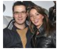
Northern Ireland Nightlife in Pictures