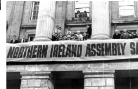
A Conflict in Pictures