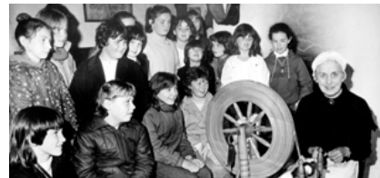
Ulster American Folk Park