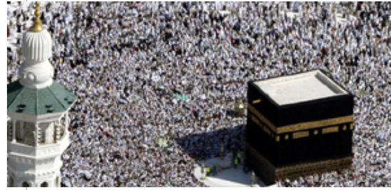
Pilgrimage to Mecca