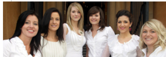
From Belfast catwalks to red carpets of LA