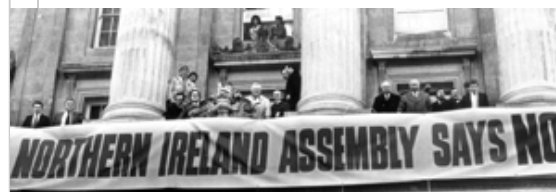
A Conflict in Pictures