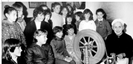
Ulster American Folk Park