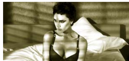
Victoria Beckham - Armani underwear