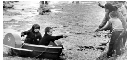
Park life. Victoria Park boat lake