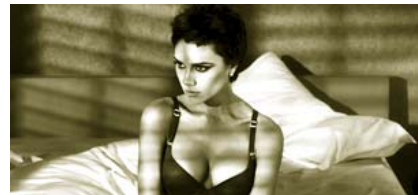
Victoria Beckham - Armani underwear