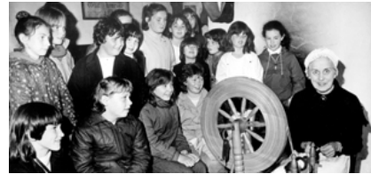
Ulster American Folk Park