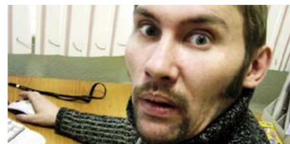
-isms: 'Yous should click here - it's class like'