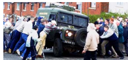
Holy Cross Primary School protests