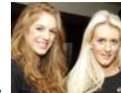
Northern Ireland Nightlife in Pictures