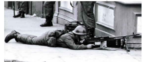
A Conflict in Pictures