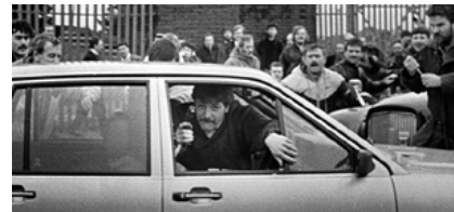
1988 - Corporals stripped, beaten and shot dead