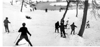
Ulster under snow