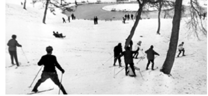
Ulster under snow