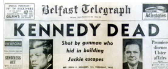
From The Belfast Telegraph Archives

Gerry Adams knows all about "right and proper" doesnt he!! NOT!