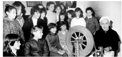
Ulster American Folk Park