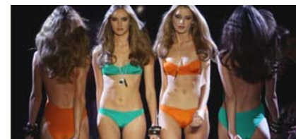
What's hot on the catwalks