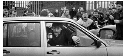
1988 - Corporals stripped, beaten and shot dead