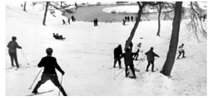
Ulster under snow