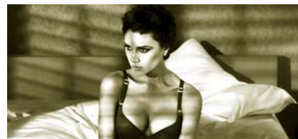
Victoria Beckham - Armani underwear