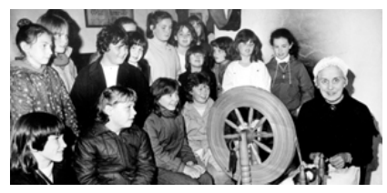
Ulster American Folk Park