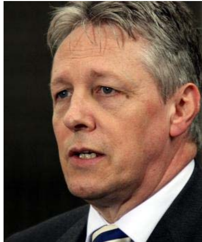
First Minister Peter Robinson

“The single biggest point made by the SDLP to Eames/Bradley was that their proposals should be measured against the standard of moving forward on an ethical basis. This is the standard the SDLP will use to judge any proposal including any proposal for payments to victims and survivors.”