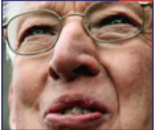
IAN PAISLEY INTERVIEW