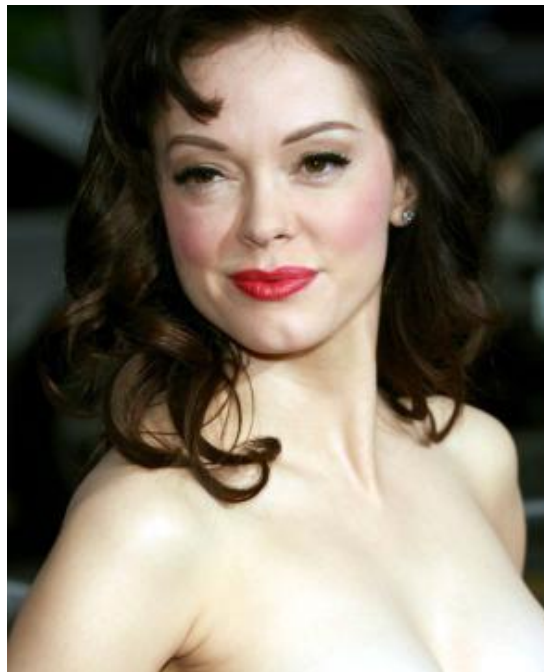
Rose McGowan says 'her heart just broke for the cause'