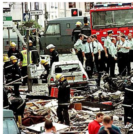
BLOWN APART: Omagh was the most deadly terror atrocity in Northern Ireland, yet errors made by the police in their investigation led to the acquittal of the chief suspect.

That, however, was another reason to believe that Omagh's killers would be found quickly. A peace of sorts had come to the north, but it was a new thing, and precarious. Clearly,