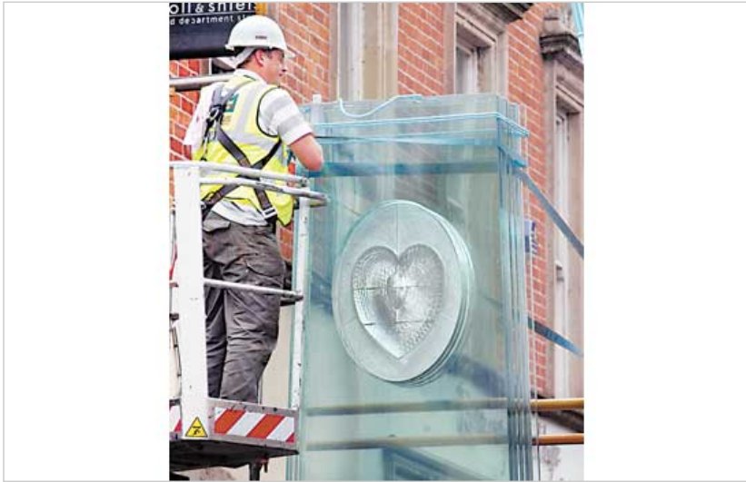
Heart of glass: The Omagh bomb memorial sculpture

A memorial sculpture erected in Omagh at the weekend to commemorate the victims of the 1998 bombing in the town was last night criticised by one of their relatives.