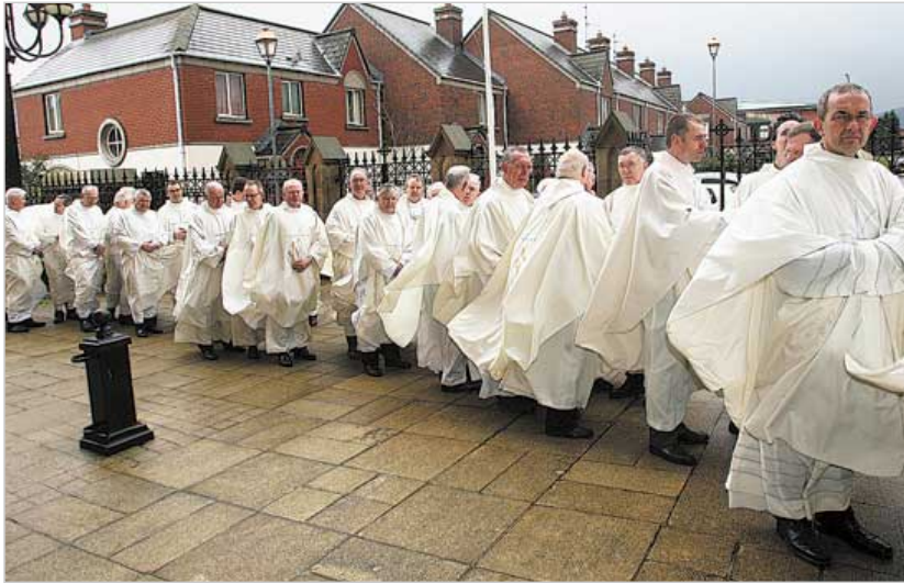
MASS ARRIVAL: Priests arrive at St Peter's Cathedral in west Belfast for the Mass of the Chrism yesterday