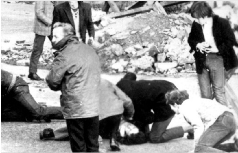
HORROR: The aftermath of the Bloody Sunday shootings in which 13 people died

SCIENTISTS at a secret government research centre were asked by the British military to develop non-lethal weapons as a matter of urgency in the wake of Bloody Sunday, it has been revealed.